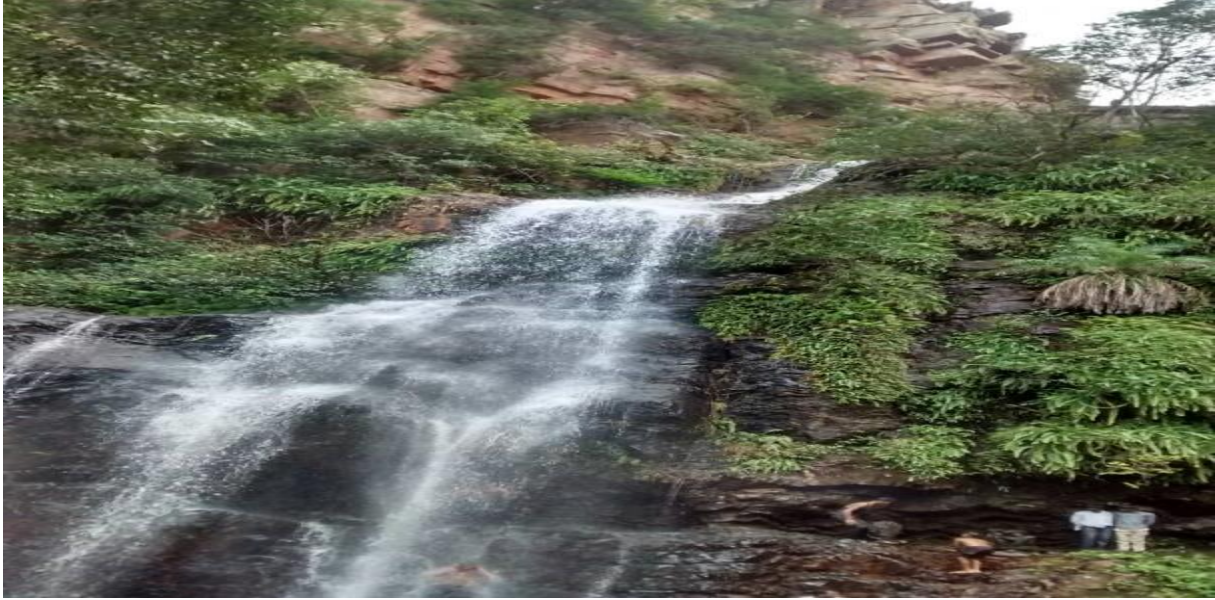
A picture of Waterfalls captured at Penchalakona