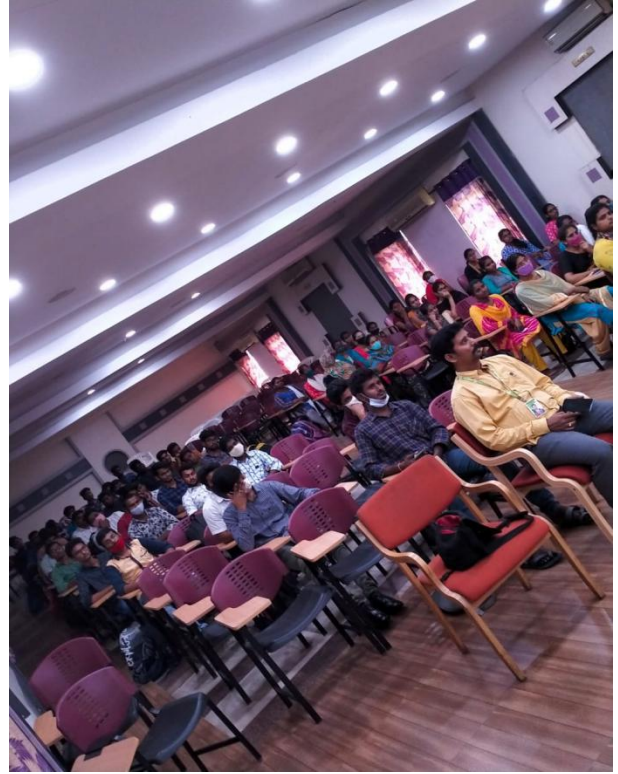
Students actively participating and showing their pictures