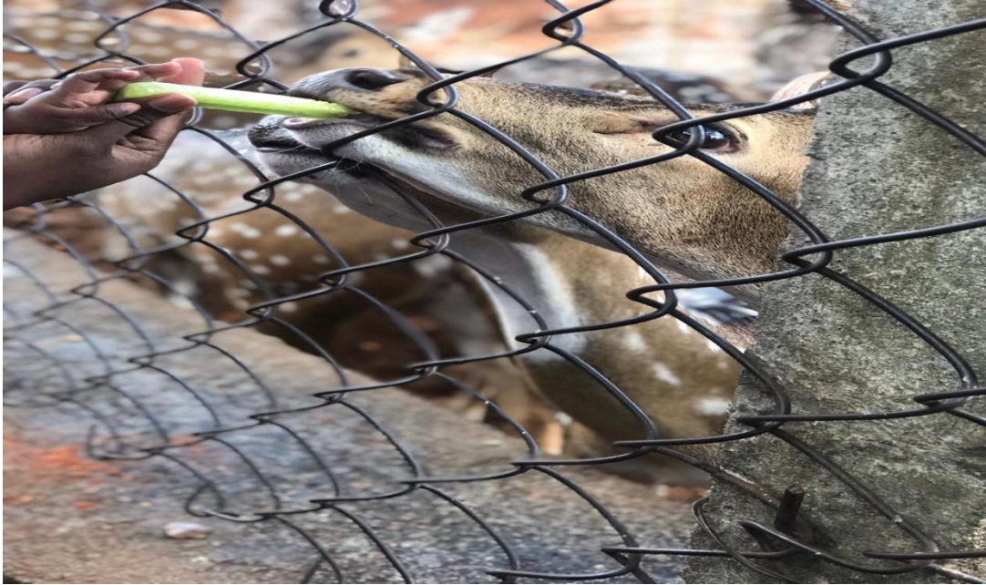
A picture of deer captured at Thirumala