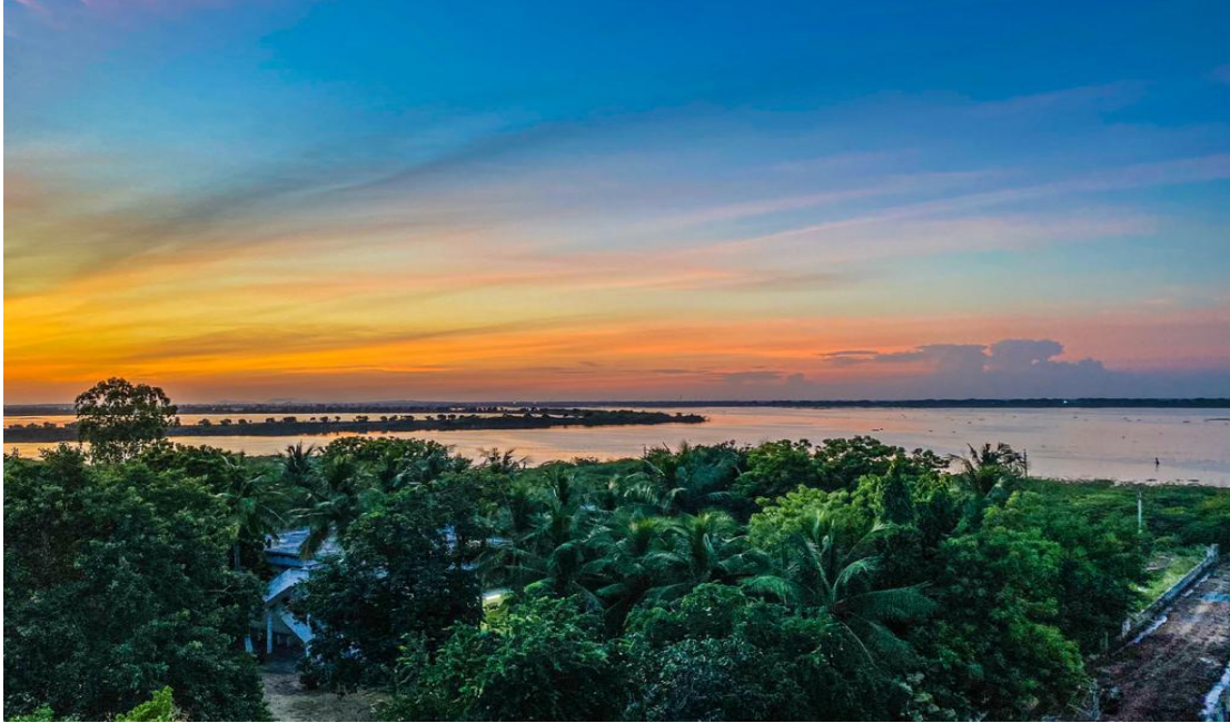
A picture of Sunset captured at Lakeview colony