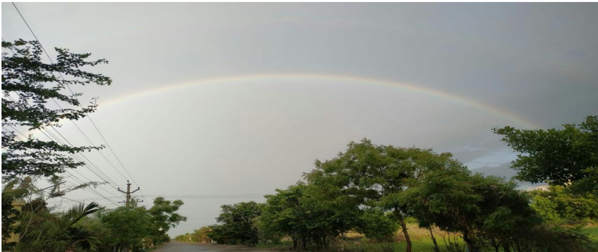
A picture of Rainbow captured at Lakeview colony